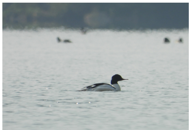
Sighting of Common Merganser at Gangrel Reservoir, river Mahanadi, district Dhamtari, in central Chhattisgarh on 14 December 2019