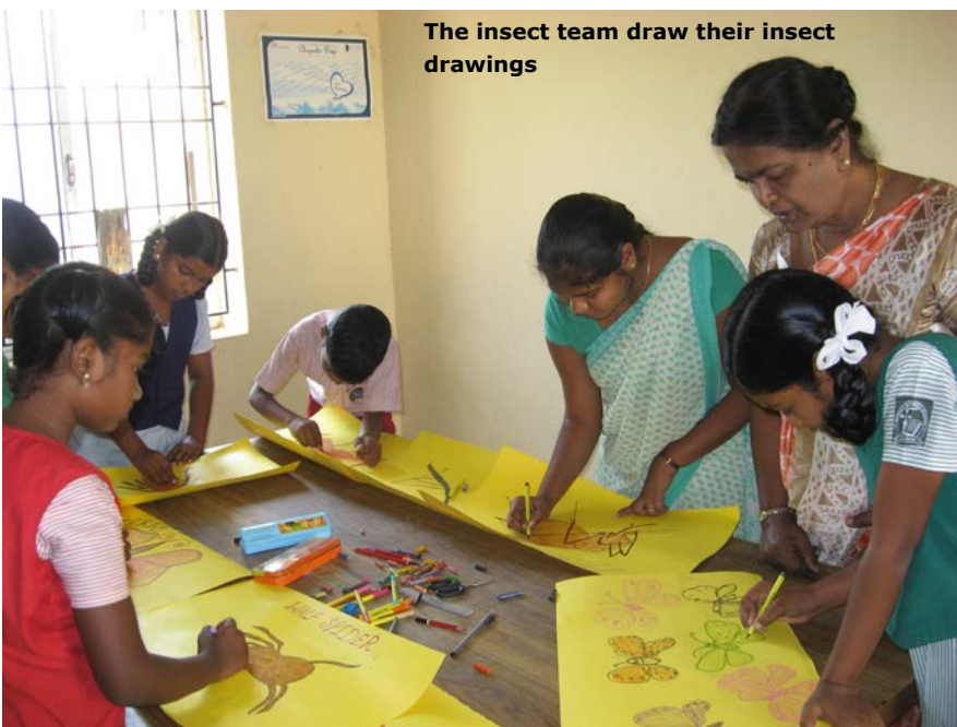
The insect team draw their insect drawings

Butterfly team admired their Daily Life Wildlife cover page given by ZOO Outreach Organisation, India. The difference between the conservation and welfare were explained. With the booklet definition for Wildlife, Daily Life Wildlife, Animal Welfare, Human Welfare, cruelty in daily life, our mistakes etc were dealt with. Starting with the shapes of their eyes, the "eyes" of animals on the last page kindled their knowledge about animals. The students learnt about the bat, bear, invertebrates, frog and rodents from the given sheet. The entire team tried the stamp album with the teacher coordinator.