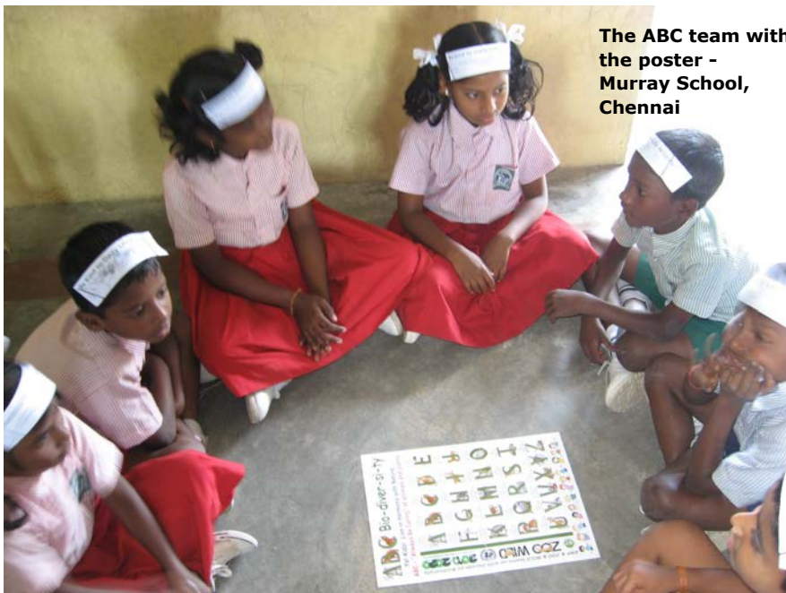
The ABC team with the poster - Murray School, Chennai