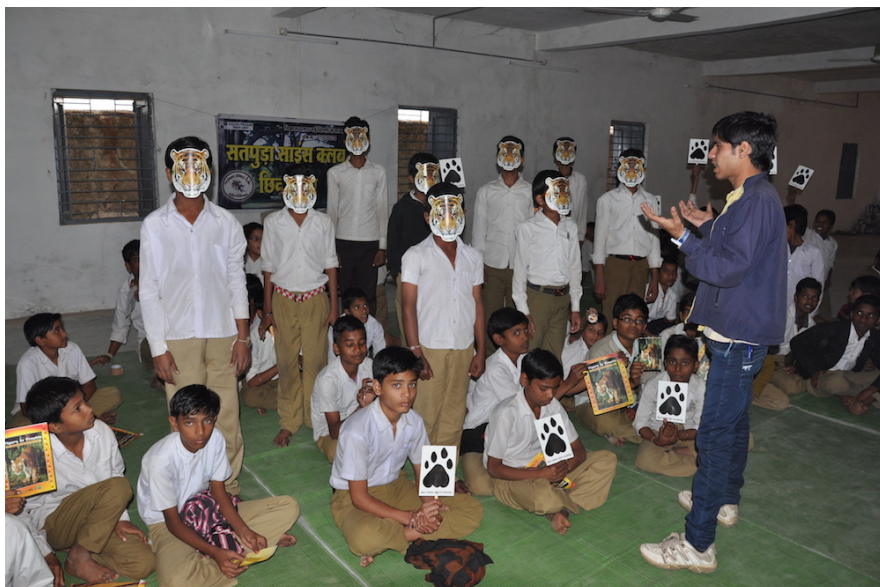
Tiger awareness programme by CEE, MP