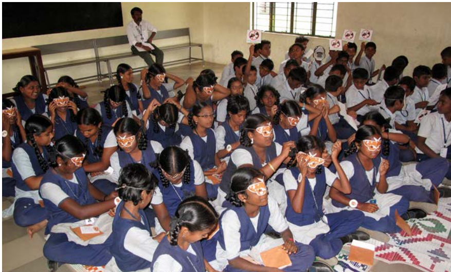
Students with butterfly mask - IEF, Madurai