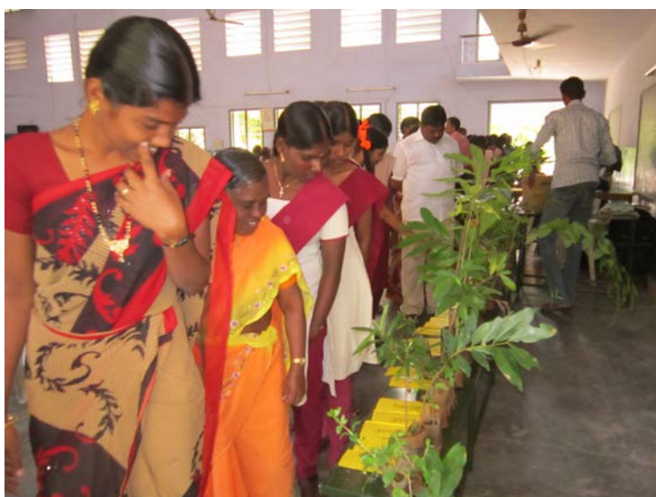
Plants with names displayed to the participants at Samariah St. John's School