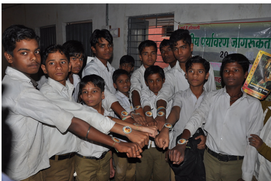
Students with tiger rakhi taking pledge to save the big cats