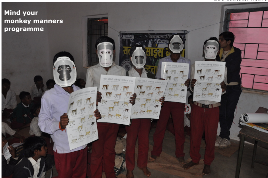
Mind your monkey manners programme

AWF Golden Jubilee at Samaria St. Johns HS School, Kulasekaranvilai, Tirunelveli Animal Welfare Fortnightly celebrated at the St. Johns school.