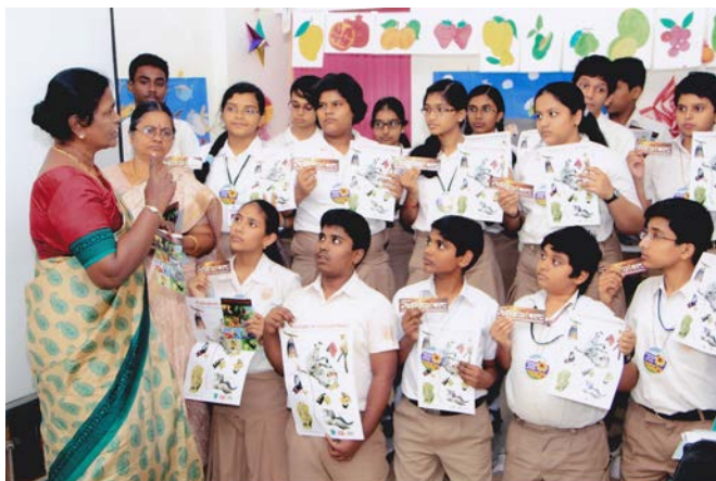
The importance of pollinators explained to the participants - National Public School, Chennai