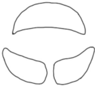
Figure 1e. Teeth bands of Glyptothorax granulus

count 35-36; caudal peduncle height 48.3-56.0% its length.