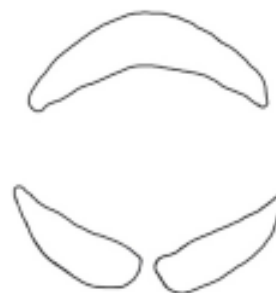
Figure 1c. Teeth bands of Glyptothorax ventrolineatus

Material Examined: 15.i.2003, 6 exs., Iril river, Ukhrul district, Manipur, India, 85.8mm SL (holotype) and 85.1–94.5mm SL