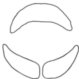
Figure 1d. Teeth bands of Glyptothorax ngapang sp. nov.

A Glyptothorax species with the following combination of characters: body plain with no longitudinal lines, head rounded, depressed, its depth at occiput 60.2–61% HL; occipital process separated from the dorsal pterigiophore by a considerable distance, its length 2 times its width; thoracic adhesive apparatus well developed, with a depression in the center which is open caudally, the apparatus width 78.9–85.0% its length; dorsal spine serrated posteriorly on the distal part with 6 antorse serrae; adipose dorsal fin well developed and there are no series of ridges or bumps in front of it; skin granulated; total vertebrae