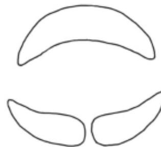
Figure 1b. Teeth bands of Glyptothorax manipurensis

A species of Glyptothorax with following combination of characters: head pointed and large, its depth at occiput 66.0–72.3% its length, maximum width 79.0–84.3% HL; interorbital space 28.0–33.1% HL; A-P extent of lower jaw tooth band 20.0–20.4% its lateral extent; occipital process length three