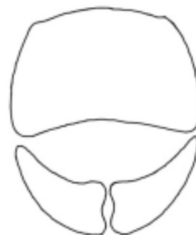
Figure 1a. Teeth bands of Glyptothorax cavia

Skin: appears smooth to touch but careful observations