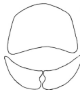
Figure 1f. Teeth bands of Glyptothorax chindwinica sp. nov.

Glyptothorax burmanicus is a Chindwin-Irrawaddy form and G. cavia , a Ganga-Brahmaputra form. Occurrence of the later